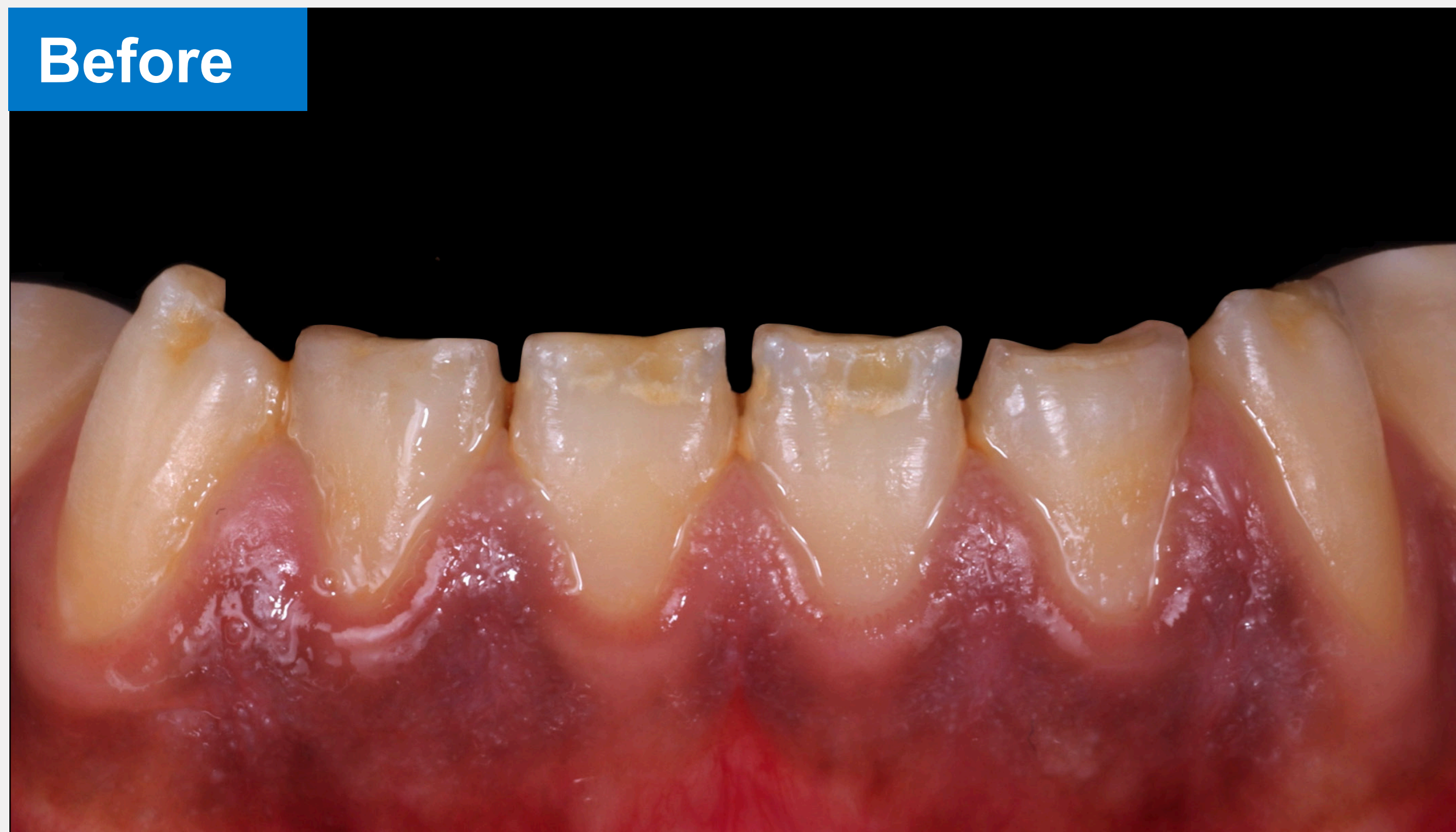
The teeth anatomy present a shape and shade disorder. The esthetic and functional treatment has to be carried out on the 6 anterior teeth.

A 22 year old patient wishes to have a global esthetic treatment in order to correct shape anomalies of the mandibular incisivo-canine area. The clinical evaluation reveals an enamel defect, classified as an chronological hypoplasia of the enamel .