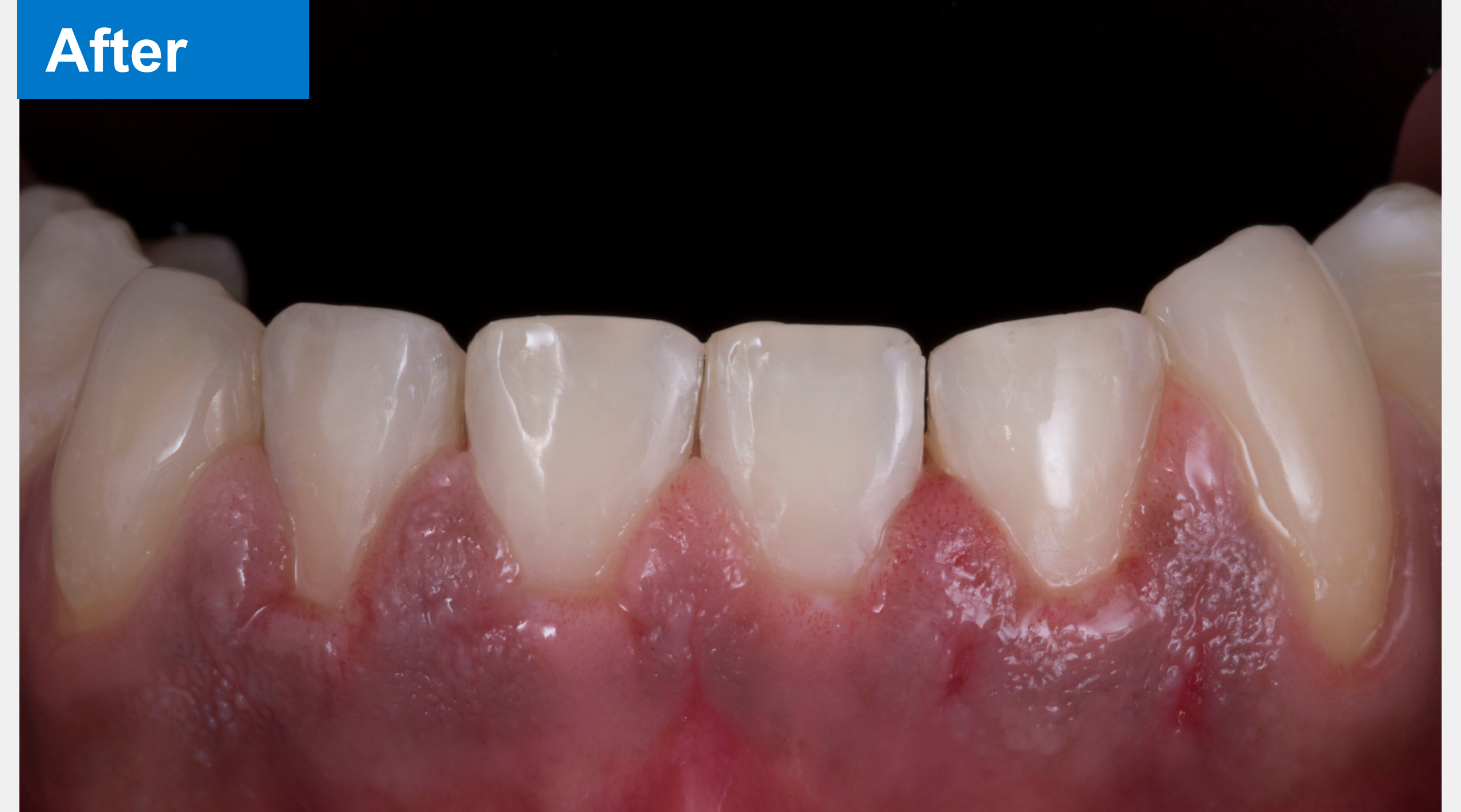
The conservative treatment allowed to restore natural shape and color through an innovative technique with direct composites restorations.